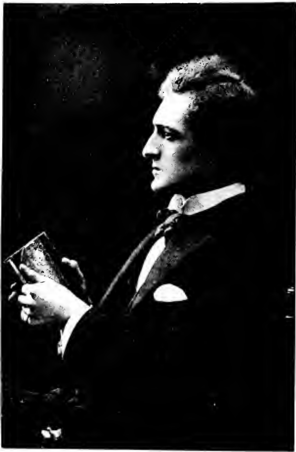
Richard Le Gallienne